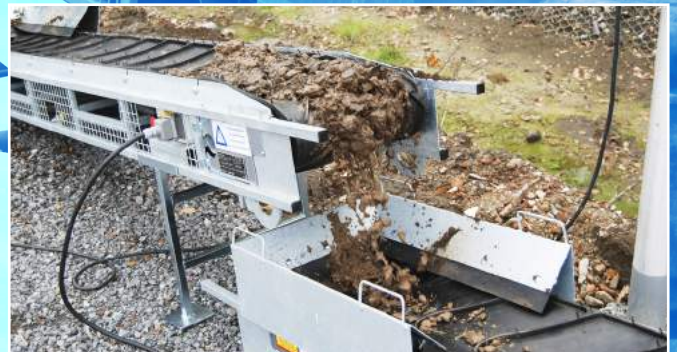
Even easier installation!