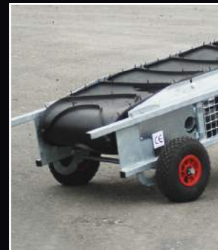
Set of wheels